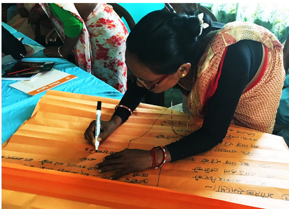
A conflict victim writes down priorities and proposal ideas during a workshop held in Mahendranagar, Kanchanpur District, in November 2018.

Each level of government is now tasked with protecting not only Nepal’s sovereignty and national interests, but also with upholding the rule of law, human rights, and the separation of powers, and advancing an equitable society based on plurality and inclusive representation as well as the country’s overall development. 6 Local governments are now empowered to devise and implement programs across a range of sectors—education, health and sanitation, agriculture and livestock, social security, employment assistance, poverty alleviation, community development, and recordkeeping, among others. (See Table 1.) Funding for these expenditures is to come from revenue from local sources and fiscal equalization, 7 conditional grants, 8 complementary grants, 9 and special grants at the national and provincial levels. 10