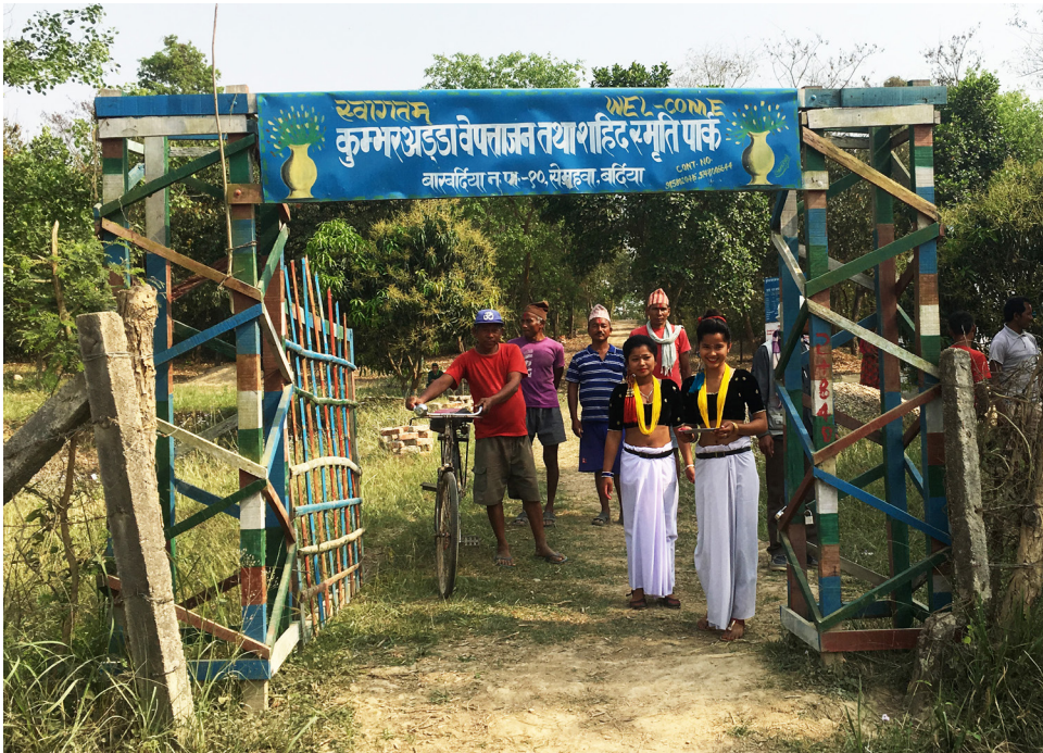
A visit to the Kumvar Adda Disappeared and Martyrs Memorial Park located in Barbardiya Municipality, Bardiya District.