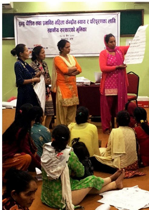
Women conflict victims prepare their demands for a meeting with local government officials during a workshop held in Nepalgunj, Banke District, in March 2018.

Most recently, in May 2018, CVCP published an advocacy paper titled “Reparative Needs, Rights, and Demands of Victims of the Armed Conflict in Nepal,” which presented findings of a comprehensive study of conflict victims’ common reparative needs, as well as reparative needs of specific categories of conflict victims. 33 And in June 2018, 28 women conflict victims came together in Kathmandu and drafted a “Women Victims of Conflict Justice Manifesto,” detailing their needs and demands. 34